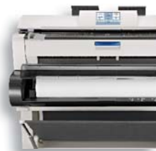
Front System Access